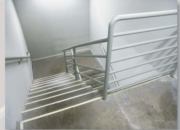
Stairwells and Landings