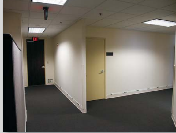
Hallways and Corridors