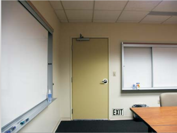
Conference Rooms and Interior Spaces (Especially SCIF's)